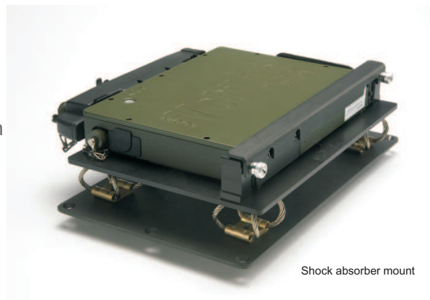
Shock absorber mount

Removable 2.5" SATA Solid State Drive Programable "watchdog" Holder for vehicle mounting Docking list with DVI and Analog LCD connection GSM/GPRS, HSDPA GPS Bluetooth W-Lan a/b/g Modem v.90 Extra RS232/422/485 Built in vehicle adapter 10-32V 12,1" and 15" DVI TFT LCD with USB hub and speaker with or without touch screen Internal UPS battery Shock absorber mount CarDock, vehicle docking with cooler (active or passive)